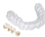
Moulds for temporaries