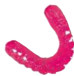
Splints for diagnostics