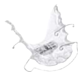
Orthodontic retainer and expansion plate