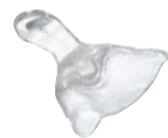
Individual impression tray