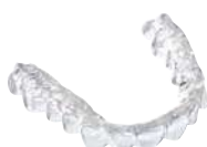
Splints Material: DURAN® or DURASOFT® pd

Compact machine, great range of applications