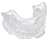
Positioner Material: BIOPLAST® (transparent)