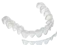
Bleaching tray Material: COPYPLAST® or BIOPLAST® bleach