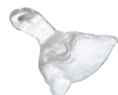
Individual tray Material: IMPRELON® (clear/opaque)