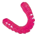
Splints for diagnostics Material: BRUX CHECKER® (red)