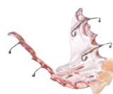
Temp. dentures Material: BIOCRYL® C (rose transparent)