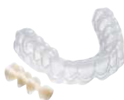
Moulds for temporaries Material: COPYPLAST®