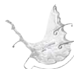
Retention plate Material: BIOCRYL® C