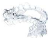
IST® device Material: DURAN®